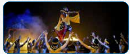
BALI NUSA DUA THEATHER