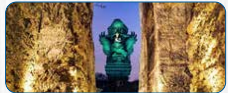
GARUDA WISNU KENCANA BALI