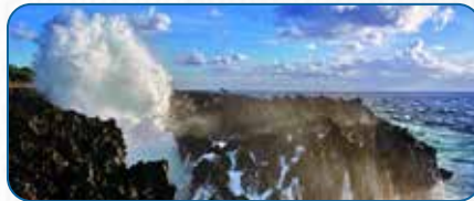
WATER BLOW NUSA DUA