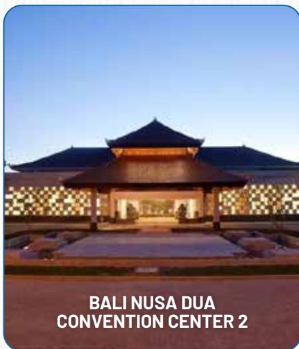
BALI NUSA DUA CONVENTION CENTER 2