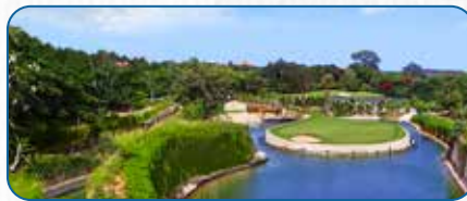
BALI NATIONAL GOLF CLUB